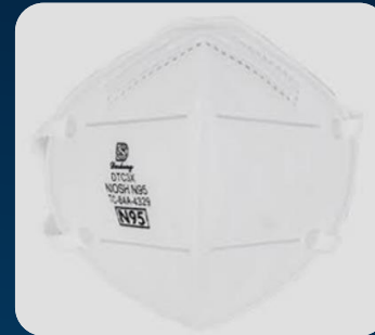
KZ001-DTC3X- 95FOLD NIOSH